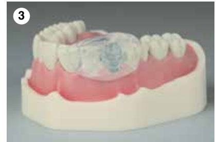
3 Fast setting time (1:20 min. intraoral)