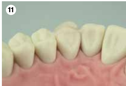
11 Excess removal and polishing with appropriate rotating instruments and if possible finishing strips