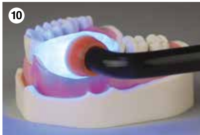
10 40 sec light curing through the matrix. Repeat the process after the removal of the matrix