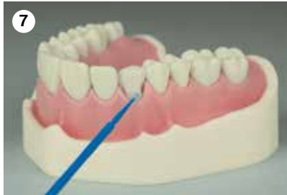
7 Application of an adhesive system, e.g. Harvard InterLock ONE