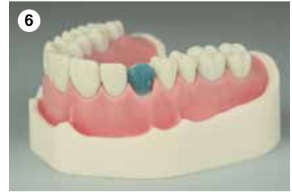
6 Etching of the prepared surface with Harvard Etch