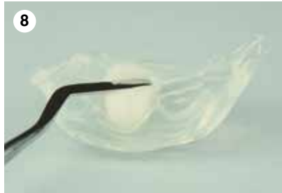
8 Application of a slightly heated packable composite in the matrix, e.g. Harvard UltraFill