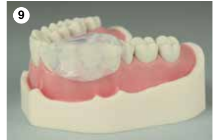
9 Correct repositioning of the filled matrix in the oral cavity