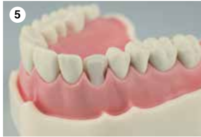
5 Preparation with bevelled enamel