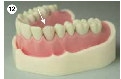
12 Finished direct composite restoration