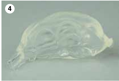
4 Complete matrix