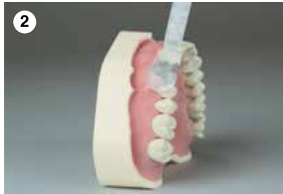
2 Harvard TransMatrix application on the prepared surface and adjacent teeth