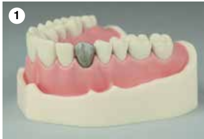
1 Initial situation