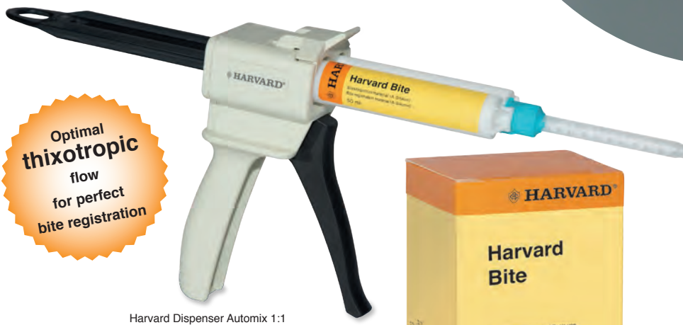
Harvard Dispenser Automix 1:1