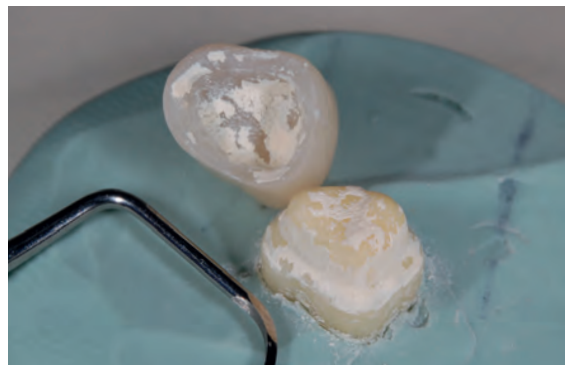
Widespread competitors' product: The material stays on the core